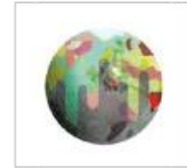
8. KINGDOM OF GOD