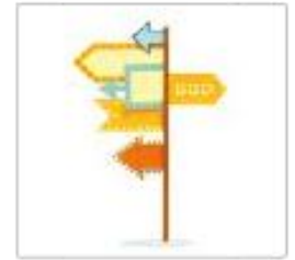
4. PEOPLE OF GOD